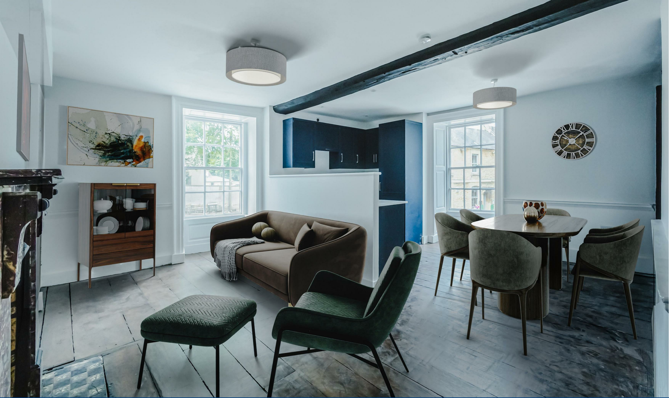
White Hart Mews, Calne £315,000